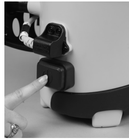
Turn off main power switch and unplug unit from wall outlet.