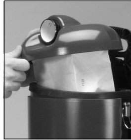
Release the two latches and lift off lid.