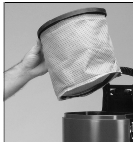
Remove cloth filter bag, clean, dust and replace.