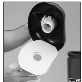
Insert new paper bag making sure to align lid nozzle with bag hole and replace latches.