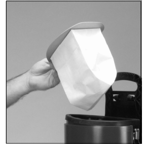
Separate lid from paper bag insert and dispose of paper bag.