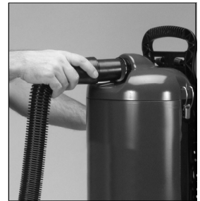
Remove vacuum hose from top of unit.